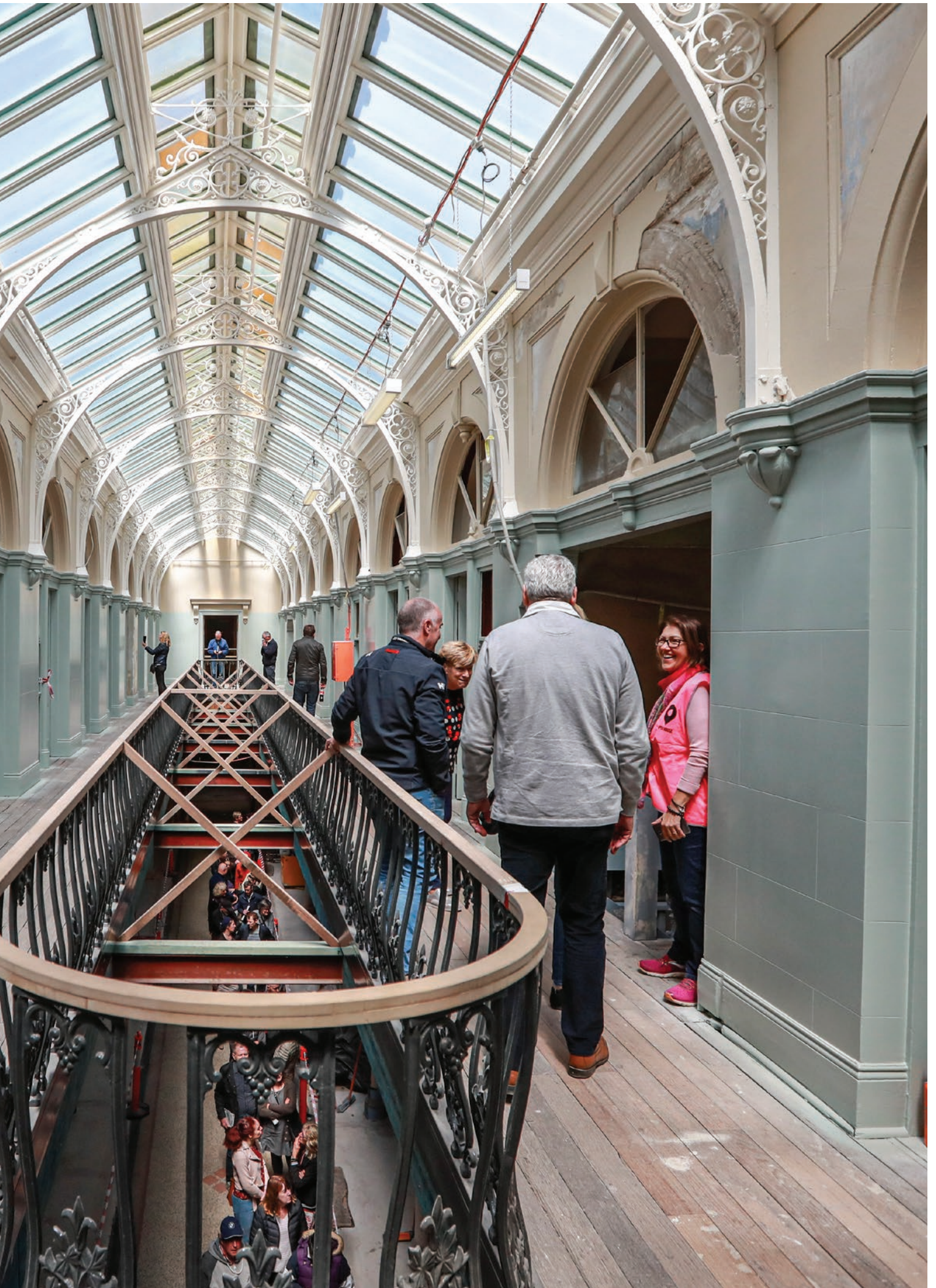
Beehive Building