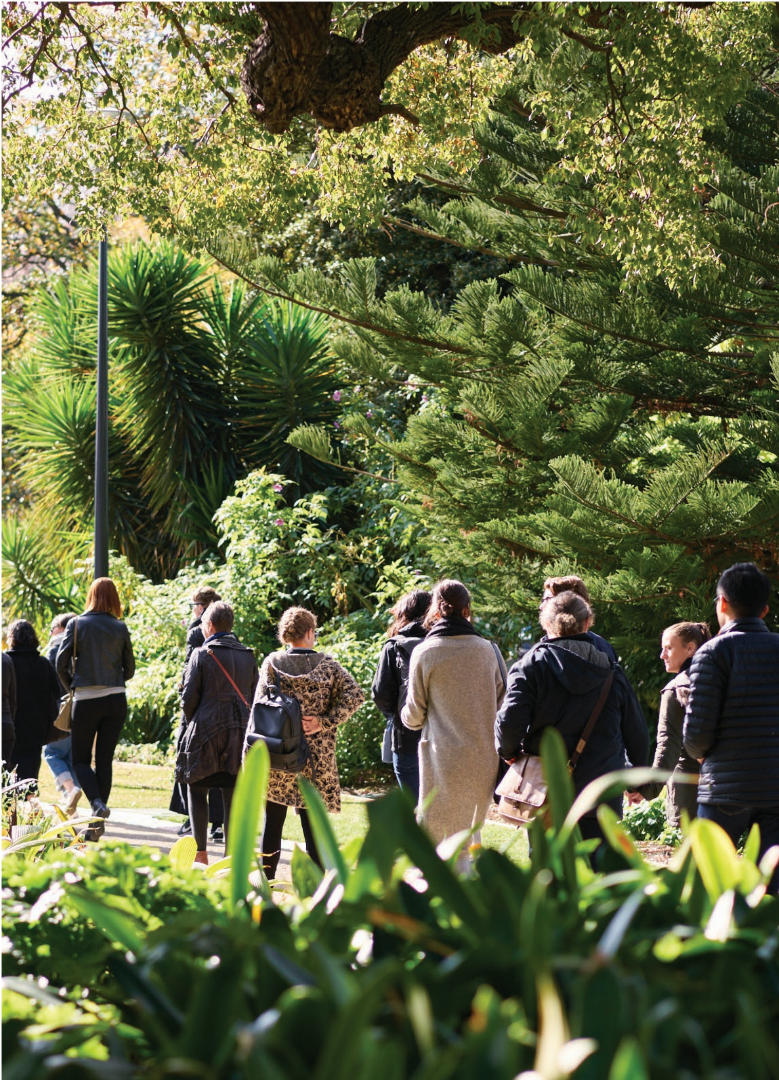
COVER: The Stables + ABOVE: Parliament House Gardens