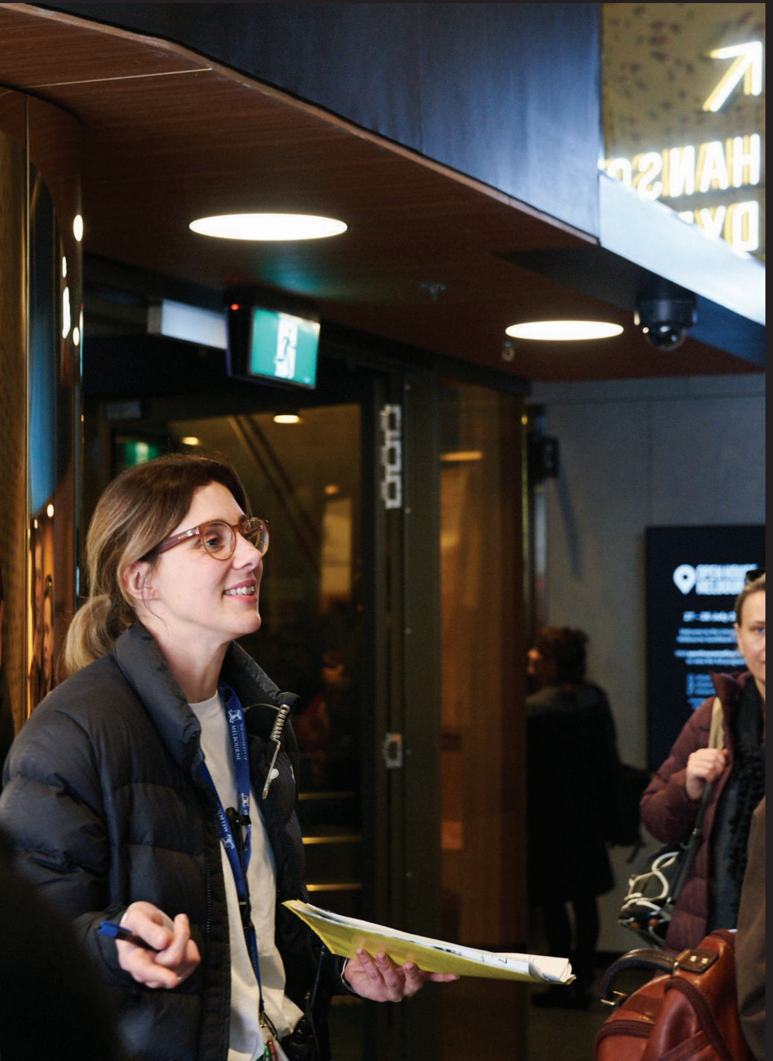
Ian Potter Southbank Centre