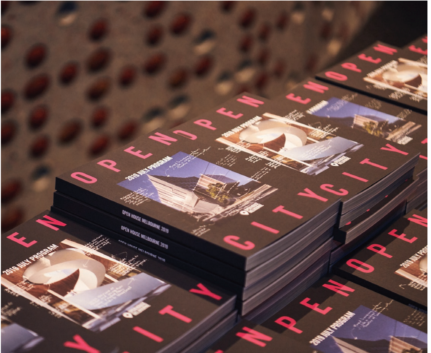
2019 Open House Melbourne program