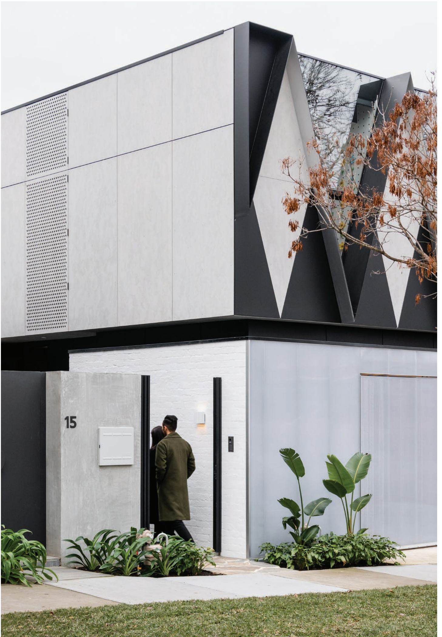
The Summit