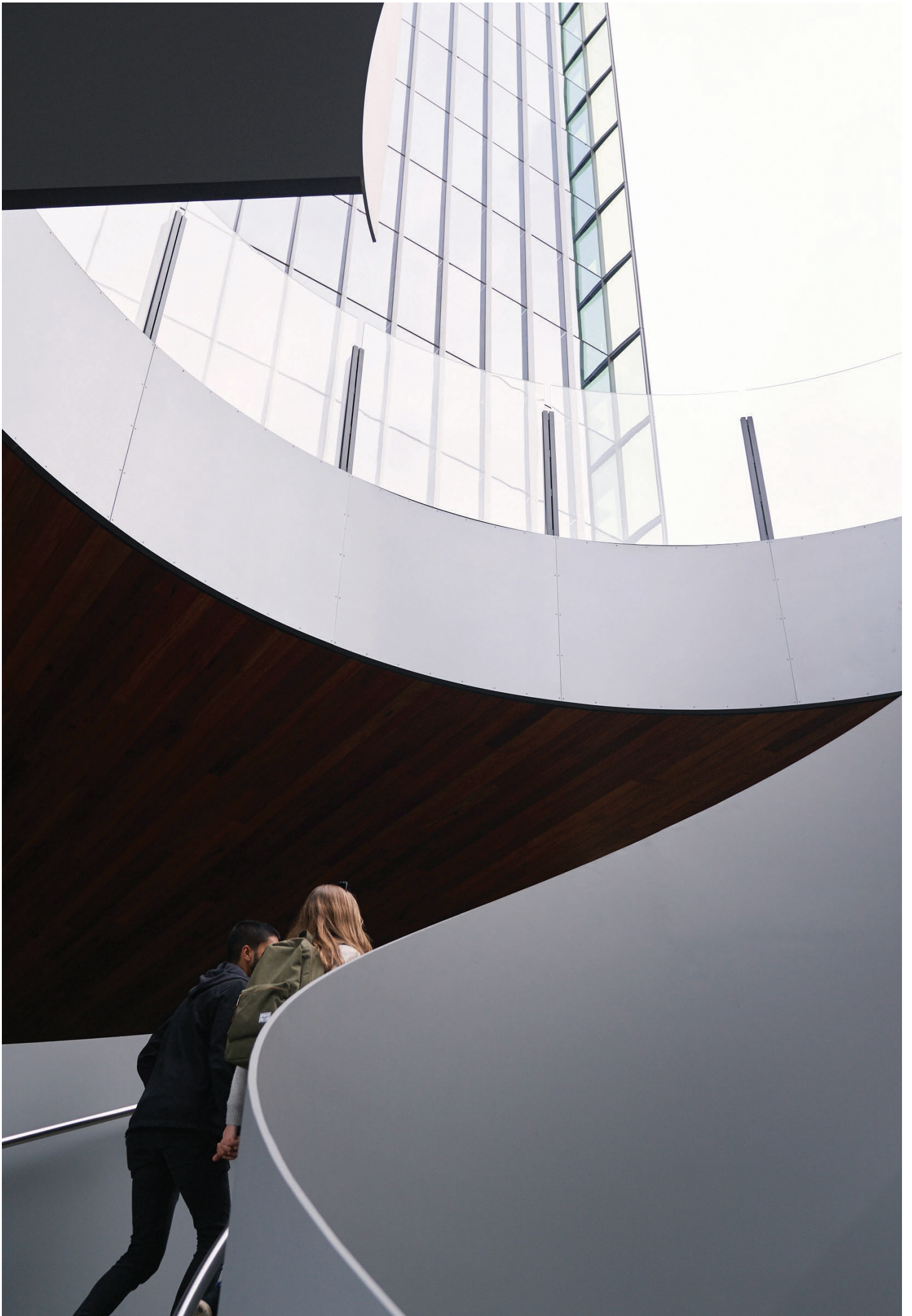
Melbourne Quarter