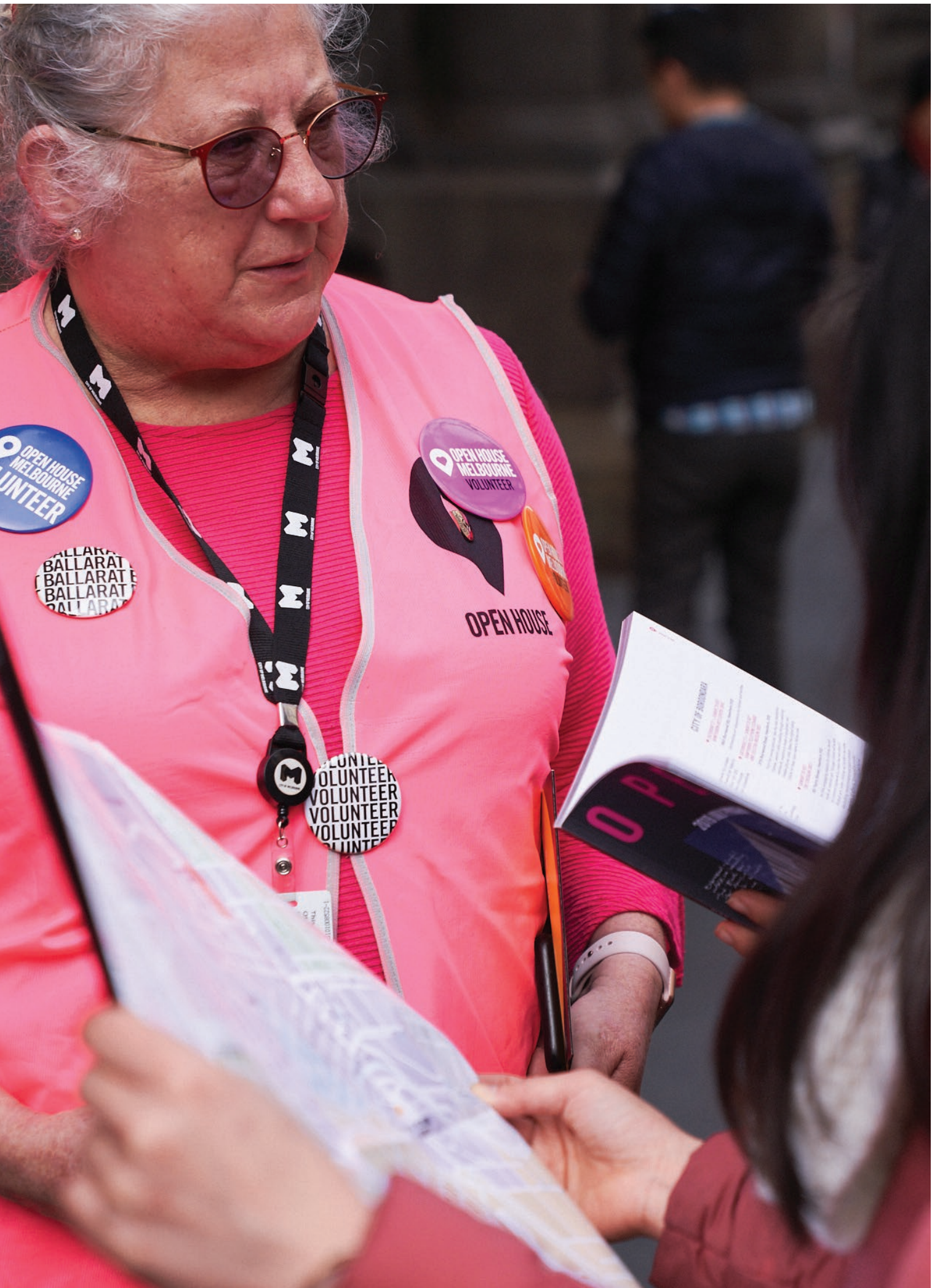
Volunteer at Melbourne Town Hall Visitor Centre