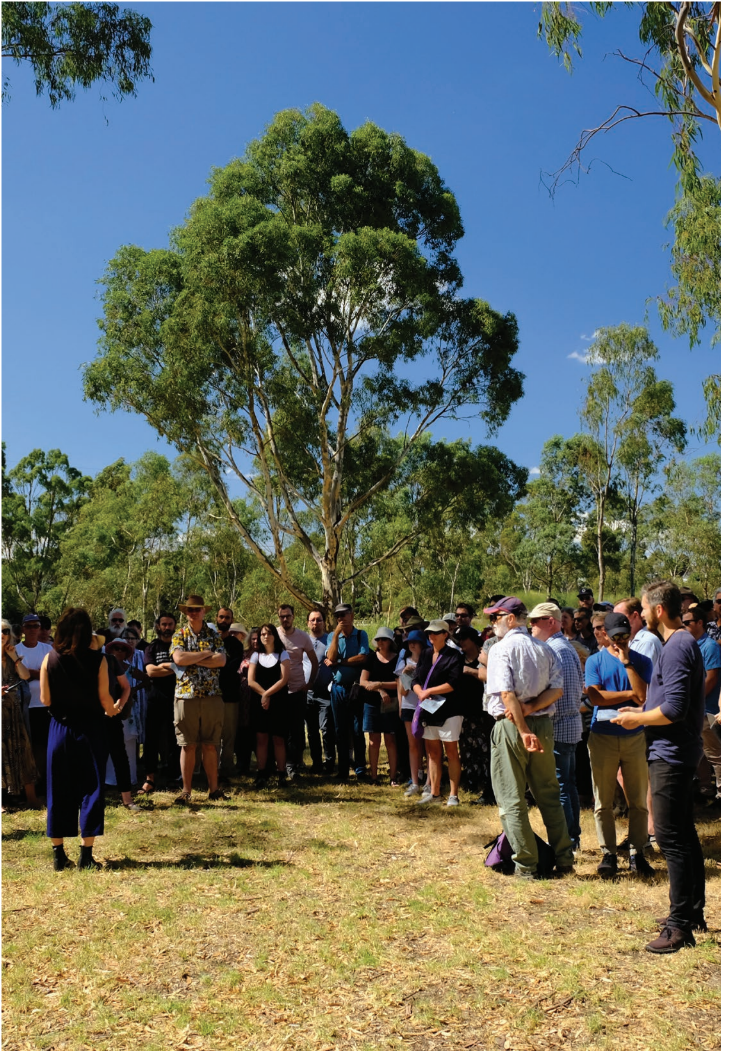
Commuter Afloat, Waterfront, Melbourne Design Week