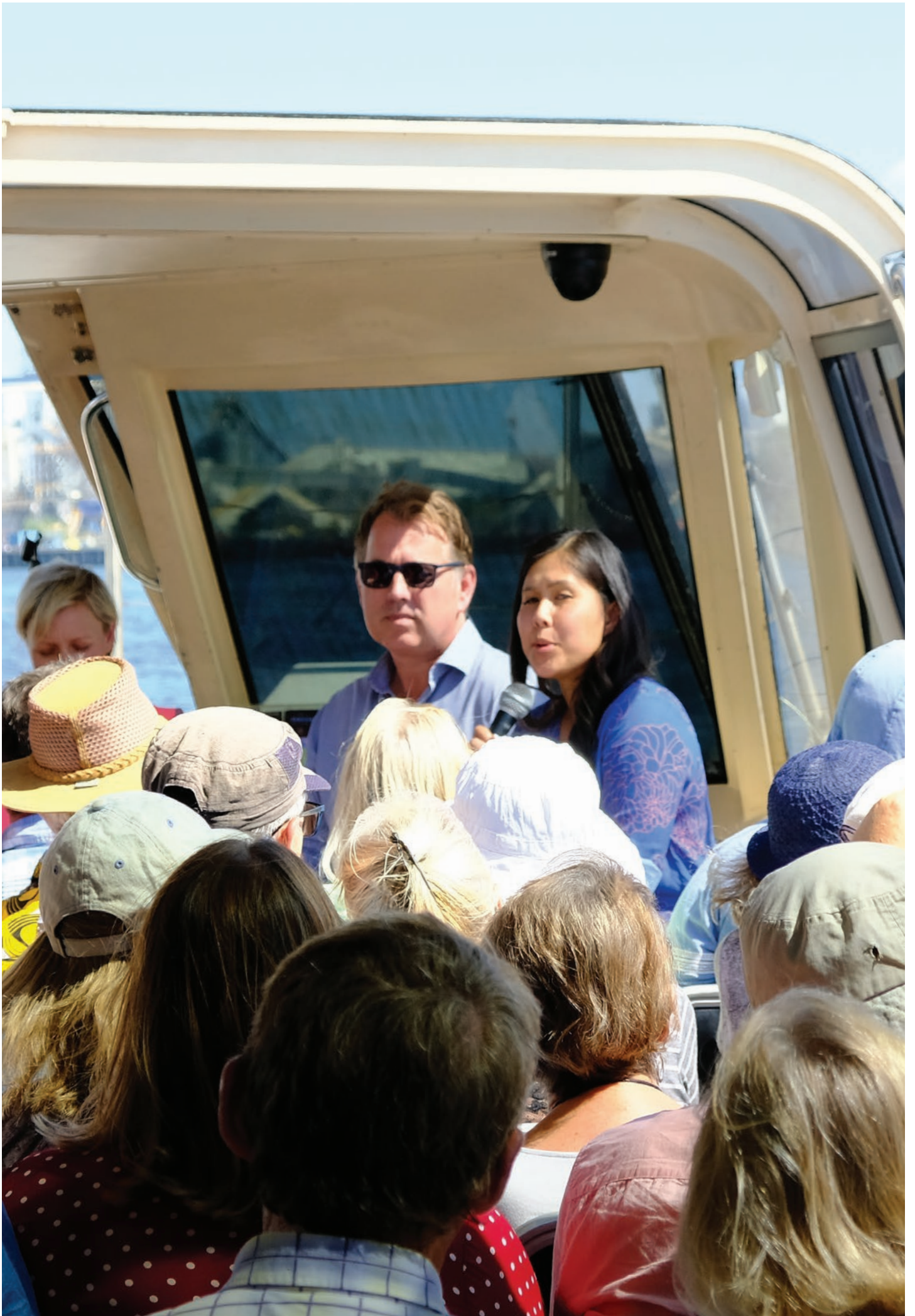
Commuter Afloat, Waterfront, Melbourne Design Week